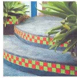
Get this exterior stained finish with Resene Concrete Stain Blue.

"There's always something happening in the garden, something about to burst into colour," she says. H